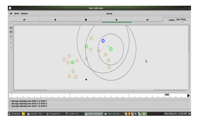
Fig. 2: Snapshot for data reporting

Figure 2 shows snapshot of data reporting. Nodes 1,9,13 are mobile sinks. For node 7 the nearest mobile sink within the range is 9. Hence node 7 directly sends data to mobile sink node 9.