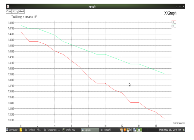
Fig. 4: Comparison of total energy consumption for without sink positioning and with sink positioning

Figure 4 shows comparison of energy consumed when the mobile sinks are at random points and when the sinks are positioned at certain nodes. It can be observed that when the mobile sinks are positioned denoted by E1, the energy consumption is reduced when compared to energy consumed when the sinks are at random points denoted by E0. Therefore the energy remaining in the network is more when the mobile sinks are positioned.